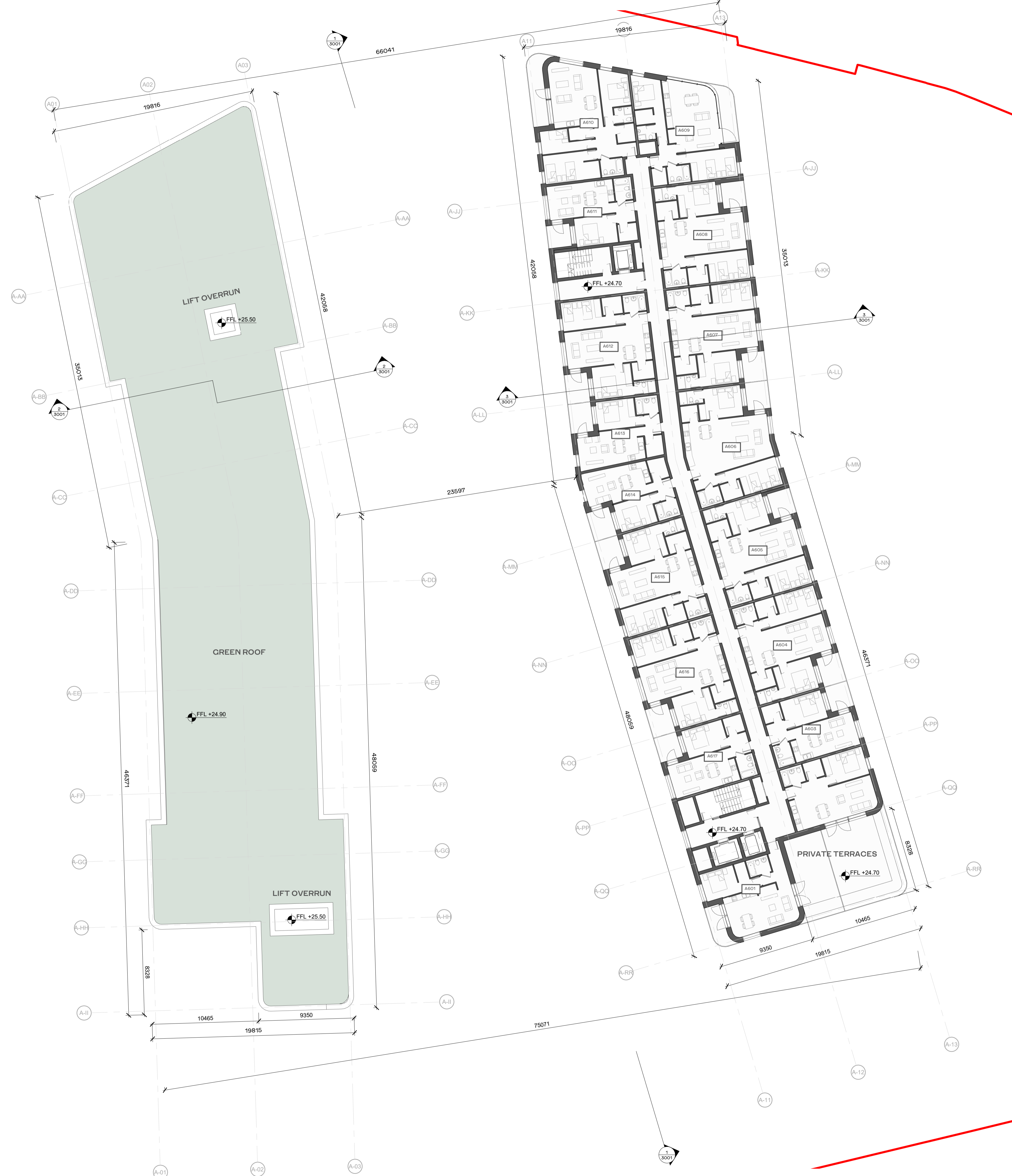
1 - ZONE 01 - BLOCK A - SIXTH FLOOR

Henry J Lyons Architecture + Interiors henryjlyons.com +353 1 898 3333 info@henryjlyons.com 53-54 Pearse Street Dublin D02 K466